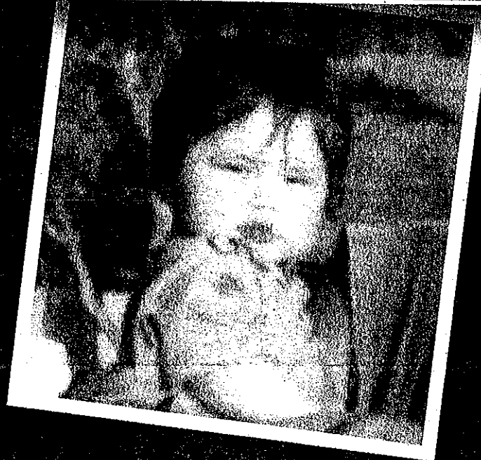
MURDER VICTIM PHOENIX SINCLAIR

No sight, no service Apartments turn away blind woman » PAGE 2